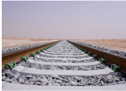
The main line of the UAE National Rail Network extends from Ghuweifat on the border of the Kingdom of Saudi Arabia, and passes through the emirates of Abu Dhabi, Dubai, Sharjah and Ras Al Khaimah.

It is one of many multi-billion projects underway or being explored by governments globally, including in Australia , Poland and Colombia , as well as major e-commerce giants such as Amazon , as they seek to boost economic growth and stabilise global supply chains. However, such projects pose massive costs and logistical challenges, including a lack of rolling stock, drivers and redundancy of tracks and capacity at port rail yards.